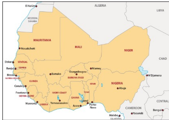
Map of Present-Day West Africa

Africa is a complex, beautiful continent rich with history. Today, Africa is home to fifty-four recognized countries with over 1,500 languages spoken. It also contains both the largest hot desert and longest river in the world. As the second-largest continent, its geography, climate, and cultures are quite diverse . 1 Geographically, Africa is broken up into five distinct regions: Northern, Southern, Central, Eastern, and Western. Each region hosts unique ecosystems and populations with vibrant histories. West Africa, in particular, has an extensive history of powerful empires.