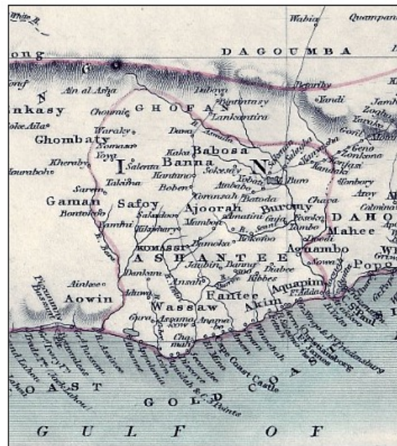
Map of Asante Kingdom c. 19 th century

In the late 1600s, an ethnic 3 subgroup of Akan-speaking people settled and flourished in the area of present-day Ghana. Small chiefdoms such as the Fante, Denkyira, Bono, Akwamu, and Asante all prospered, building wealth by cultivating fertile farmland, securing vast deposits of gold, and maintaining busy trade routes. Of them all, the Denkyira dominated the region, but the Oyoko clan of the Asante saw an opportunity to grow the Asante people's influence.